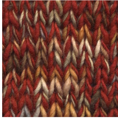
MCM-8891 / MCL-2106