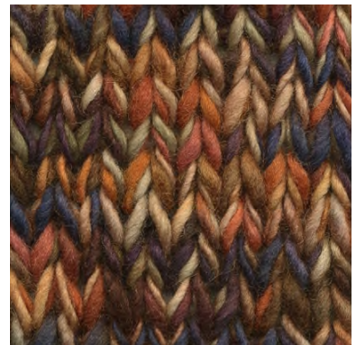
MCM-8891 / MCL-6554