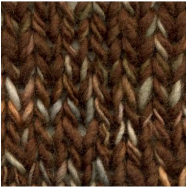
MCM-8891 / MCL-2247