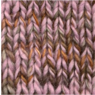
MCM-8891 / MCL-2603