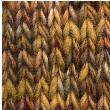
MCM-8891 / MCL-2264