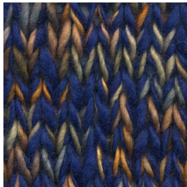
MCM-8891 / MCL-2450