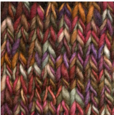
MCM-8891 / MCL-7032