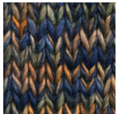
MCM-8891 / MCM-7073

patterns, yarn and necessities for curious knitters