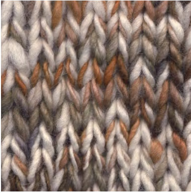
MCM-8891 / MCL-2800

Manos del Uruguay, Wool Clasica - AUTUMN MCM-8891 100% fair trade handspun wool yarn mix of semi solid en varigates colors