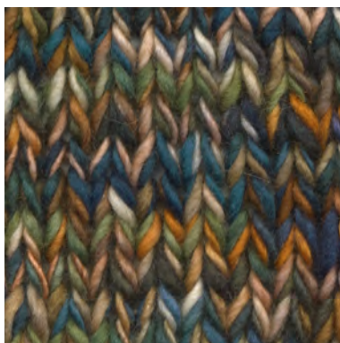
MCM-8891 / MCL-7325