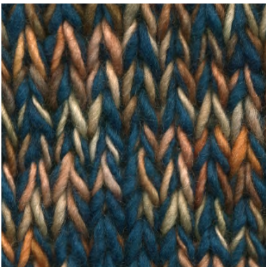
MCM-8891 / MCL-2444