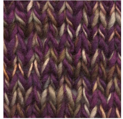
MCM-8891 / MCL-2665