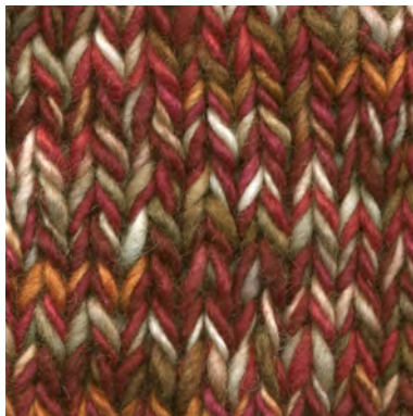
MCM-8891 / MCL-6422