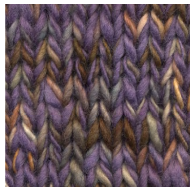
MCM-8891 / MCM-2672

patterns, yarn and necessities for curious knitters