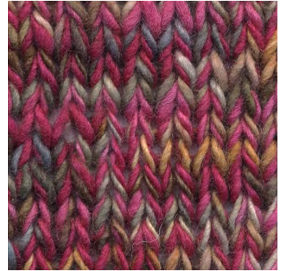
MCM-8891 / MCL-5003