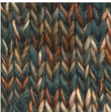
MCM-8891 / MCM-2370