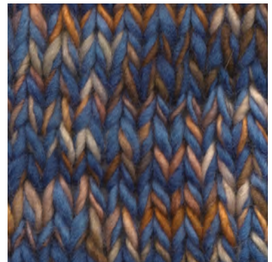
MCM-8891 / MCM-2412