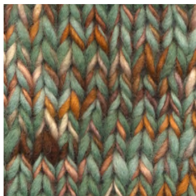
MCM-8891 / MCM-2302