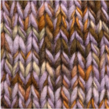
MCM-8891 / MCL-2615

Manos del Uruguay, Wool Clasica - AUTUMN MCM-8891 100% fair trade handspun wool yarn mix of semi solid en varigates colors