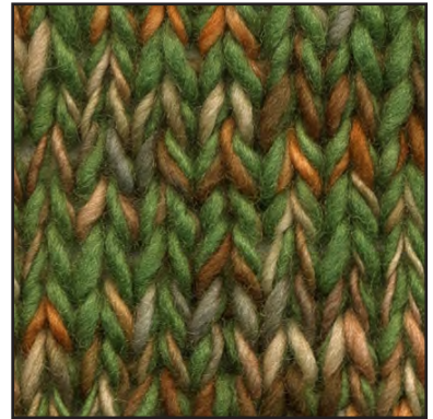
MCM-8891 / MCL-2364